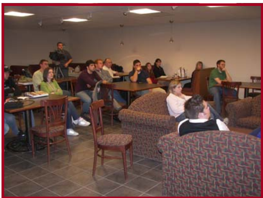
Students watch the VP debate in the Cyber Café.